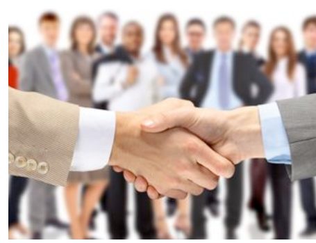
How can you contact the right buyer?

As a broker I deal with this issue every day. I've seen it with every business type and size, so when I say this, you can know that I'm speaking only from experience: If you don't price your business correctly it won't sell.